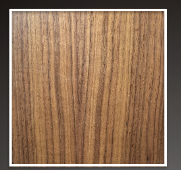
American Walnut - Reconstituted