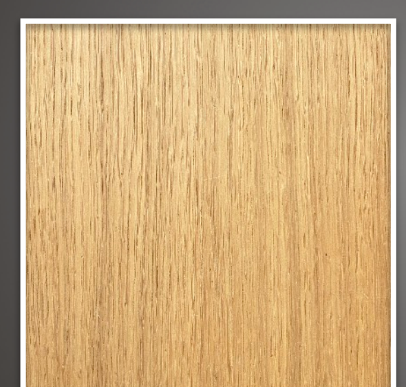
White Oak - Reconstituted