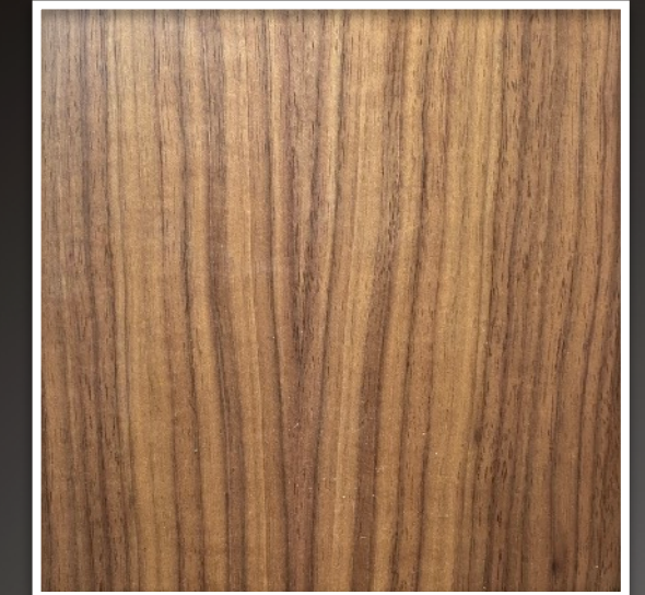
American Walnut - Reconstituted