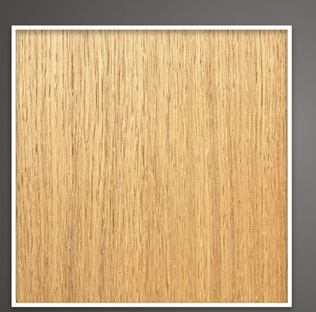
White Oak - Reconstituted