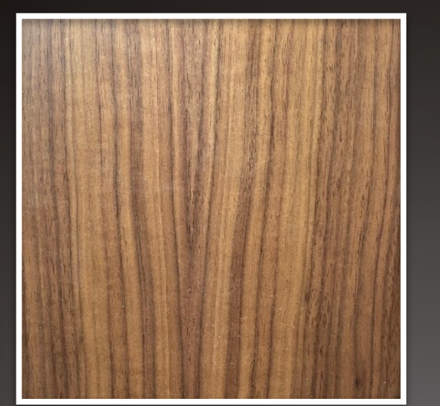
American Walnut - Reconstituted